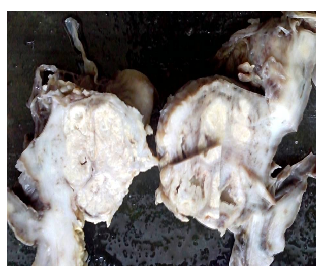
Fig. 1: Cut surface of left ovary showed cysts ranging from 0.4-1.5 cms in diameter with yellow-white areas

On histomorphological features patient was diagnosed as a case of lymphocytic oophoritis. Patient was known case of diabetes and hypothyroidism so advised further hormonal assays like FSH, LH, Prolactin, ANA, antithyroid antibodies, Anti-ds DNA to rule out autoimmune cause. FSH and LH levels were raised and antithyroid antibodies were positive. ANA was negative. On the basis of histomorphological and laboratory findings, final diagnosis of Autoimmune oophoritis was made. Patient was advised regular check-up.